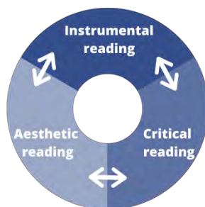
Figure 2: A dynamic reading practice connects instrumental, critical and aesthetic reading

The instrumental, critical and aesthetic stances can coalesce and complement each other for a fuller academic reading experience, as proposed in Figure 2. The tools and techniques of instrumental reading can become more effective at finding and deciphering information when combined with the questioning method of the critical stance and the creative connection of aesthetic reading. Conversely, readers can be facilitated by instrumental methods to read texts more critically and aesthetically. According to Misson and Morgan (2006), effective readers often move fluidly and purposefully on a continuum between searching texts for information, distancing oneself to evaluate texts and participating in texts creatively. These stances can change and morph into each other depending on changing contexts and purposes. Rosenblatt (2005) also noted the necessity of both aesthetic and efferent reading and the need to balance these based on reading circumstances.