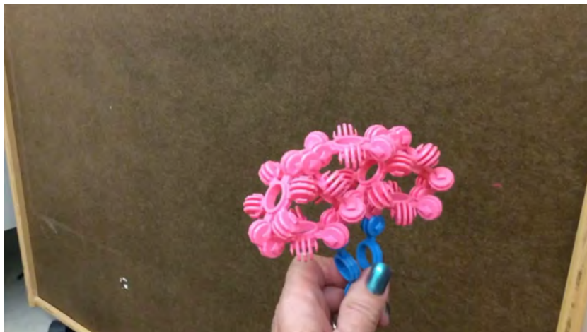
Fig. 1: Aisha's flower

In addition to providing opportunities to practice and enhance their English skills, several educators reported that ELLs used the iPad apps to consolidate their use of their home languages. Children created slideshows in their home language, either on their own or with peers who spoke the same language. This allowed them to enhance their home language and strengthen a home-school connection, which is vital for multilingual children. Aisha, for example, created a flower with classroom materials, asked a research team member to hold it while she photographed it with the iPad, then recorded herself singing in her language. She called it her language song: