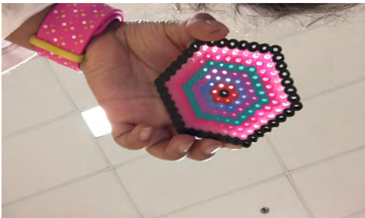
Fig. 2: Photo taken with iPad

The open-ended apps used in this study, 30 Hands and Explain Everything , can be used to create very simple drawings or photos or more complex multimodal creations. Children were able to use the apps at their individual ability levels and could progress at their own pace. Children in the study who faced learning challenges were able to communicate their ideas in ways that helped them to overcome the barriers they faced with traditional paper-and-pencil tasks. For example, children could take a simple photo of the room, themselves, a classmate, or a creation they had made. The photo below was taken with an iPad by the artist, a four-year-old student. She was able to independently and effectively document her artistic creation as a digital slide without recourse to speaking, reading, or writing.