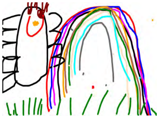
Fig. 3: Rainbow with smiling insect

Children could also choose a blank slide and use the drawing tools to experiment with lines and colours, or they could draw a scene such as the one below. This child has drawn a scene with a rainbow over a field of grass with an oversized, smiling insect. It certainly communicates a story with emotion and energy, but without the use of audio or text.