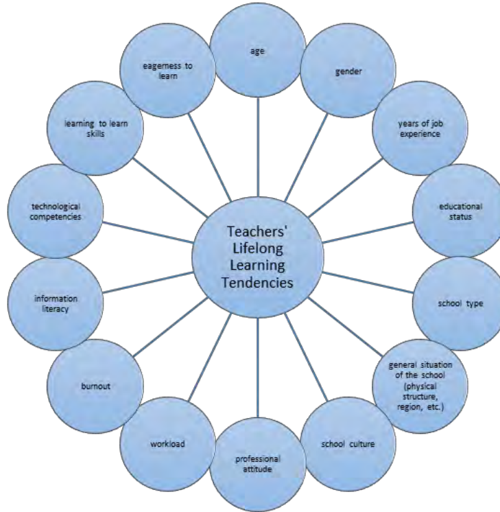
Figure 2. Teachers' LLL tendencies related elements

and skills they need in relation to information literacy competencies during their pre-service training, in other words, in teachers training institutions.