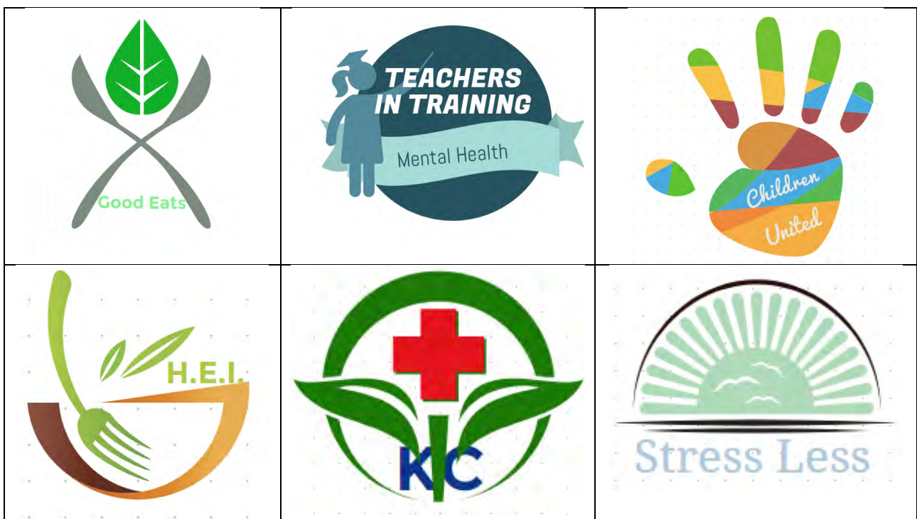
Figure 1. Public health students' design work related to logos

The instructional design procedures used in this course are known as the ADDIE approach which stands for “analysis, design, development, implementation, evaluation” (Branch, 2009, p. 2). The media that they designed could be used in their lesson plan and teaching. Students worked on this capstone assignment for eight weeks in groups of two or three students. The total number of the groups was 11. Students regularly recorded their analysis, design, development, implementation, and evaluation process into a shared Google document which was accessible to the instructors and the group members. Course instructors provided weekly consultation throughout the project. At the end of the eighth week, the students implemented their training with an authentic audience.