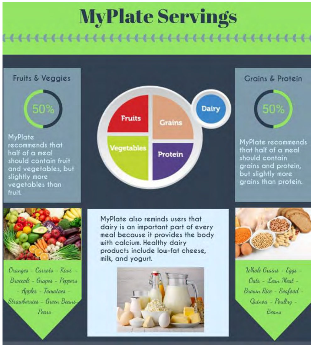
Figure 4. An example of infographic designed by the public health student group members

By giving our audience a quiz, we as instructors are able to receive evidence that our audience was fully engaged in our presentation the entire time and that they receive[d] the information correctly.