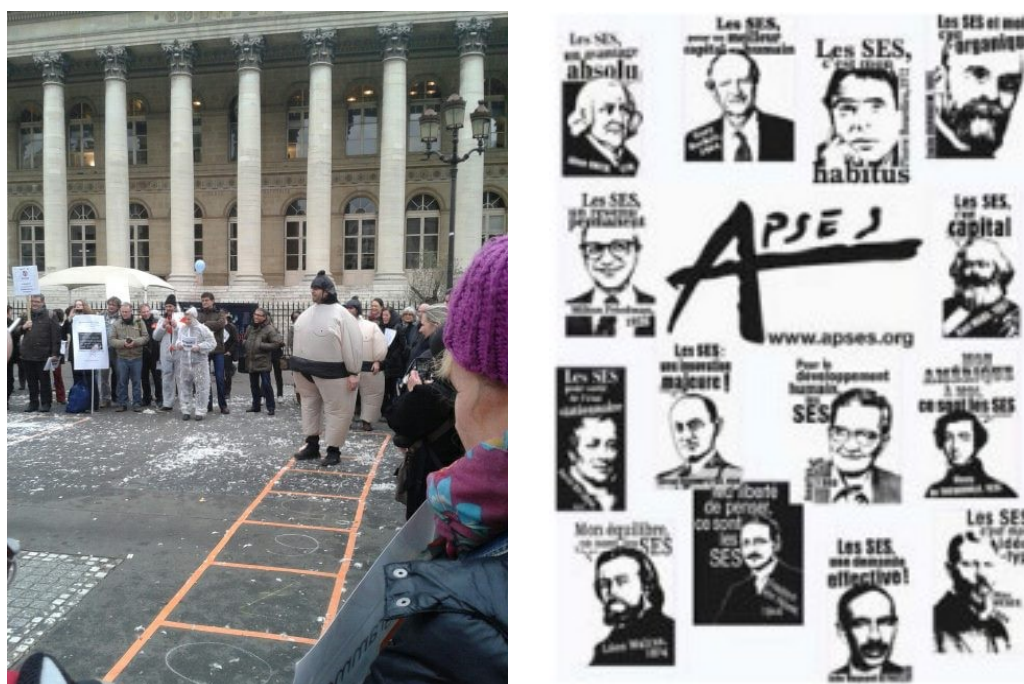
Figure 4: (right) Rally organized by APSES to demand a reduction in SES programs on 29 November 2012 in Paris. (© APSES) (left) Posters produced by APSES using famous expressions of economic and social science personalities to promote SES (© APSES)

In addition to this direct advocacy role, APSES is also developing service activities for its members (pooling of courses, discussion lists, information, conferences organisation, etc.), which help to attract them - and thus make it the most representative association of specialists with nearly 2300 members out of around 5500 teachers in 2019 -, but also ensures the socialisation of members by maintaining among them the feeling of being part of a separate and "besieged" discipline. Finally, APSES activists highlight their pedagogical expertise and mobilize that of the academics they have acquired, individually or collectively, by regularly organizing symposia where they are invited to express themselves alongside journalists and other "experts" (pollsters, etc.) to express all the good they think of SES. The association's leaders thus pay particular attention to the maintenance of this network of "constituent consciousness" (MacCarthy & Zald, 1976) which can also enable them to obtain a media resonance fund and act as a relay in the academic sphere. They can also be mobilized as scientific guarantors when APSES challenges certain aspects of the programs, not only during the public meetings mentioned above, but also in a more original way when the association decided to build what it called a "bypass program" for Year 12, in which case the aim was to reorganize the content of the new 2010 program around