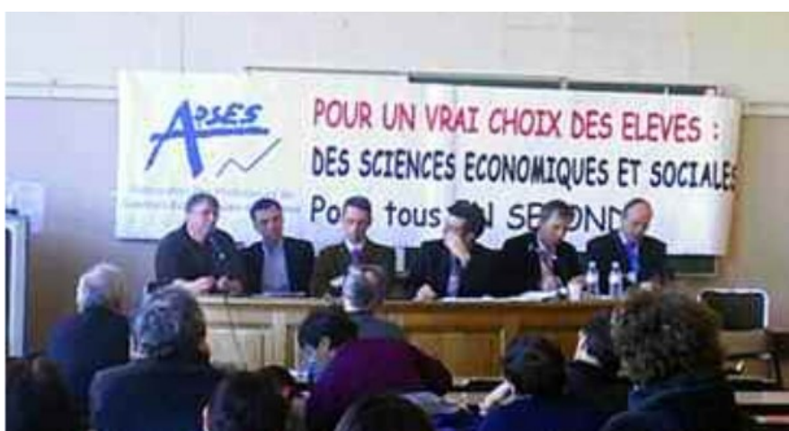
Figure 5: Assises nationales des SES organised by APSES at Sciences Po Paris in 2005

However, it must be noted that despite this resistance and the militant resources that APSES knows how to mobilize, the founding project of the SES is increasingly called into question with each curricular reform. While the programs of the early 2000s still respect this spirit, with the option in Year 11 being the successive study of the family, employment, production and consumption after an introductory chapter leaving teachers the freedom to deal with the subject of their choice to show the "SES approach" and the complementarity of economic, sociological and political perspectives with a timetable of two and a half hours per week (including 30 minutes in half class). Year 12 is organized around the study of the economic link, sociological link and political link. In Year 13, a "speciality" teaching was added to the common program focused on "growth, social change and development", although the complementary indications have become increasingly voluminous. In this optional teaching, which is in addition to the five hours per week, the aim is to cover each of the main themes dealt with on the basis of the writings of a named author (Schumpeter, Smith, Tocqueville, Marx, Weber, Keynes or Ricardo), while showing their current relevance. A real deepening that is highly appreciated by both teachers and students.