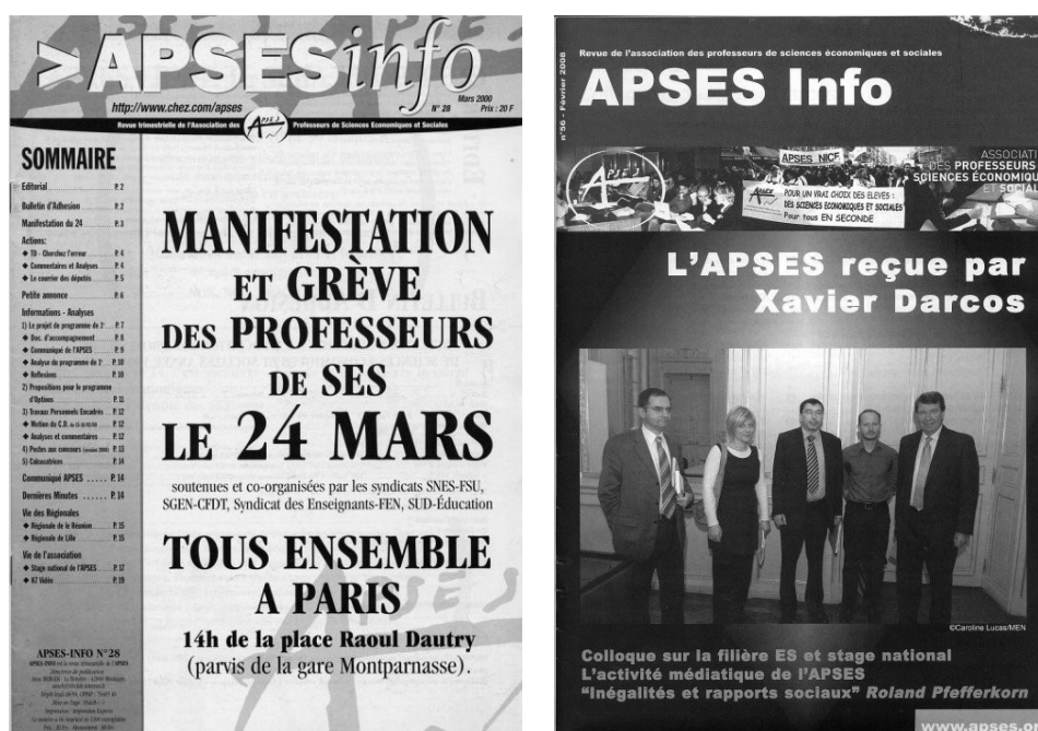
Figure 1: Frontpages of the APSES newsletter, respectively calling for a strike and demonstration by SES teachers in March 1996 and showing the national office of the association interviewed by the Minister of National Education in 2008

These various elements do not prevent the recurrent occurrence of public attacks against the SES and responses from mobilized teachers, which ultimately constitute a continuous struggle to define what should constitute "good" social science teaching in high schools. The first attacks actually come from within the education system, with teachers of neighbouring subjects worried about their land being encroached upon. These tensions thus arise with history and geography professors at the time of the creation of a single college for all students in the mid-1970s 11 , where it was considered to introduce SES, as well as with economics and management professors with whom, from the 1980s onwards, their merger with SES was regularly considered (Chatel & Grosse, 2015, pp. 30-31) 12 . At the end of the 1970s, Prime Minister Raymond Barre, Professor of Economics at the University, entrusted one of his fellow professors in Dakar, Joël Bourdin 13 , with an audit assignment. His final report radically condemns the SES and the B series which is organised around them. It provokes a strong mobilisation of the profession organised by the APSES, with a 2-day strike and a demonstration in Paris, where many prestigious intellectuals are involved, representing the different academic disciplines which form the basis of the discipline. The slogan carried by APSES is then that it is a "fight for an adjective" (the "social" of economic and social sciences).