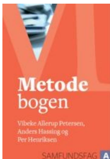
Figure 3: Teaching in methods is an important part of the preparation for further Studies (Translation: The book of methods)