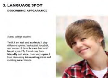
Figure 2. A photo of Justin Bieber

From the examples of printed materials found in the course book, it was noticed that the institution gave enough models for students not only as an introduction but also as the students' task. From the observation, the teachers usually discussed the tasks quickly by making short whole-class discussion and directly moved to the next task, following the course book. First, Figure 1, the authentic printed material is in the form of an article survey. It was used for Activity 1: Appearance, the task was reading the article and discussing the questions. The students then presented the result of the discussion.