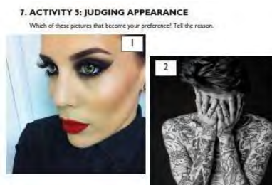
Figure 3. Photos of a woman and a man

preference from 6 photos, and giving the reason why they like and dislike them. The language features are provided below the photos, so the students could learn from them.