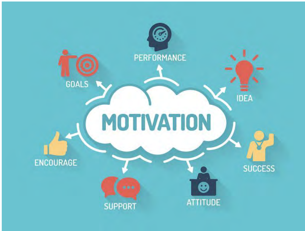
Figure 1. The results of Motivation (external and internal) (Vision Exercise Physiology, 2018).

The characteristics of the curriculum 2013 use a scientific approach and recommend learning that actualizes the full potential of students and arouses motivation (Ahid et al., 2020). Learning models that are relevant to the demands of the curriculum 2013 one of which is ECIRR ( Elicit, Confront, Identify, Resolve, Reinforce ). One of the cooperative models that can be used to improve students' mathematical reasoning abilities and learning motivation is the learning model ECIRR ( Elicit, Confront, Identify, Resolve, Reinforce ). In addition to the learning model (Sumarni et al., 2019), motivation is also one of the causes of success or failure of learning (Sriwidiarti, 2016). If the motivation is strong enough he will decide to do learning activities (Yasin et al., 2020). Conversely, if the motivation is not strong enough he will decide not to carry out learning activities (Diani, et al., 2019) because motivation arises from within or from outside himself (Badrin & Hartono, 2013; Farhan & Retnawati, 2014; Supriadi et al., 2018).