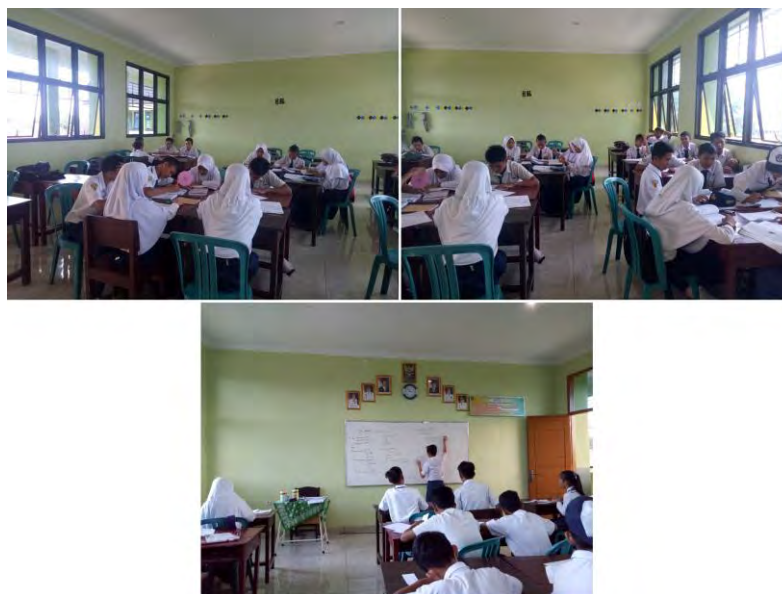
Figure 2. The condition of the class room (up: experiment class, bottom: control class)

The population of this study was all students in five classes XII Private School of Bandar Lampung in the odd semester of the 2018/2019 academic year. Samples were taken using the cluster sampling method and obtained class XII AP-2 and XII MM-1 as the experimental class, and class XII AP-1 and XII MM-2 as the control class.