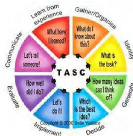
Figure 1. Chart of TASC Model Stages (Wallace et al., 2012)

Based on the analysis of this condition, we need a learning model that can support students to be good thinkers. The Thinking Actively in a Social Context (TASC) model is a series of learning that provides analytical teaching in solving contextual problems. According to Wallace et al. (2012), TASC model stages include (1) gathering and organizing knowledge based on problems, (2) identifying problem-solving ideas, (3) generating problem-solving ideas, (4) deciding and determining the best ideas for solving problems, (5) implementing the ideas in the problem-solving process, (6) evaluating the results of problem solving related to student knowledge, (7) communicating the results of problem solving in the classroom to get advice and input, and (8) learning from experience (reflecting the learning outcomes obtained during the problem-solving process). The stages can be seen in Figure 1 below.