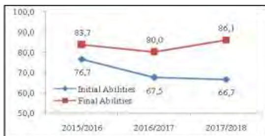
Graph 1 Averages of the Final and the Initial Abilities in the First, the Second, the Third Year