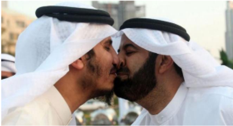
Figure 2. Two Arab People Kissing Each Other (Merdeka.com)