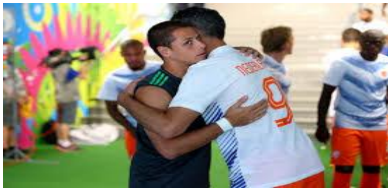
Figure 3. Two Mexican Men Embracing Each Other (berita.net).

Mulyana (2012, p. 21) argues that eye contact is another aspect of nonverbal behavior. To show respect, most people in Asia and Africa do not maintain eye contact when they communicate with older people or people who have higher status. However, this behavior is often misinterpreted by North Americans. Americans look straight into the eyes of their communication partners to show their goodwill and sincerity. Mulyana therefore adds that their behavior is often perceived as dominance by those people accustomed to lowering their gaze.