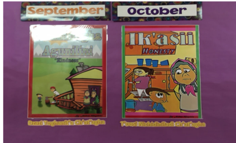
Figure 2. Tsuut’ina traditional values posters

We discuss outcomes from our work through the lens of the four principles identified earlier as guiding our partnership with Tsuut’ina Education. The first principle states that the collaboration should be relevant to community needs and priorities and increase positive outcomes. We responded to the invitation from Tsuut’ina Education to work with the Tsuut’ina Gunaha Institute to explore avenues to revitalize the Tsuut’ina language. Battiste (2002) explains, “Language is by far the most significant factor in the survival of Indigenous knowledge” (p. 17). The priority of the Tsuut’ina Gunaha Institute was to formalize instruction of the Tsuut’ina language and provide guidance and professional development support to the language instructors. As a result, we developed a scope and sequence document for Tsuut’ina language instruction that reflected a developmental approach to language learning. Additionally, we provided professional development workshops to enhance the instructors’ skills in language instruction.