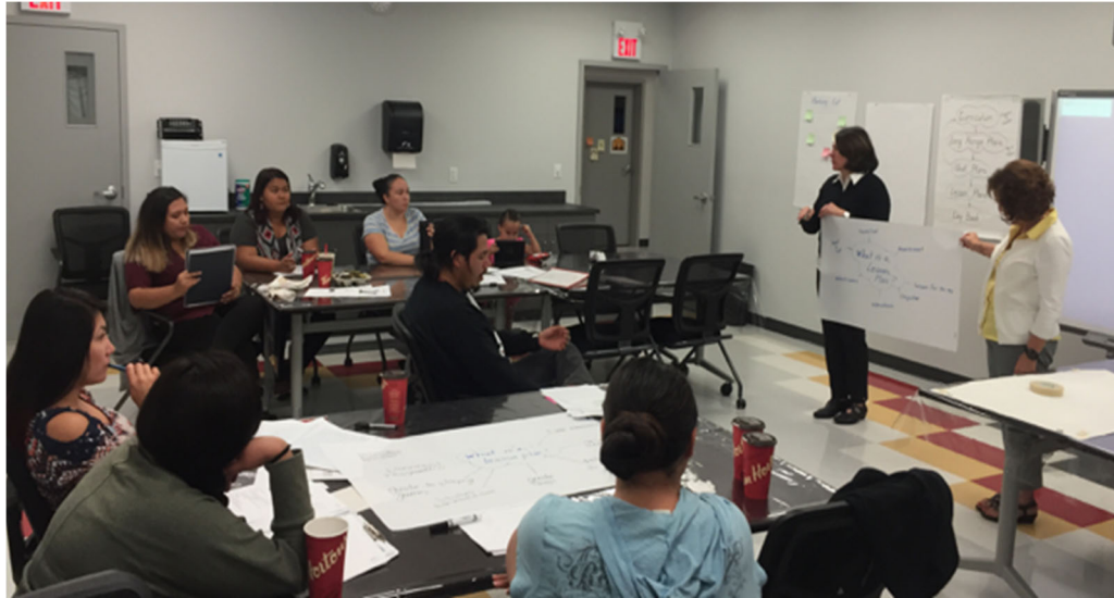
Figure 3: Tsuut'ina Gunaha Instructors' Workshop

The second principle states that the collaboration provides opportunities for co-creation in the sharing of decision making, data management, and knowledge. The scope and sequence document was co-created through our work with the Tsuut'ina Gunaha instructors. The process began with us seeking clarity about their requirements. Within those conversations, we identified a need for linguistic components for instruction at each grade level. We incorporated the feedback into the development of a draft scope and sequence document. We worked together with the instructors to complete the final version of the document (see Figure 3). The language instructors gave a final approval to the scope and sequence document.