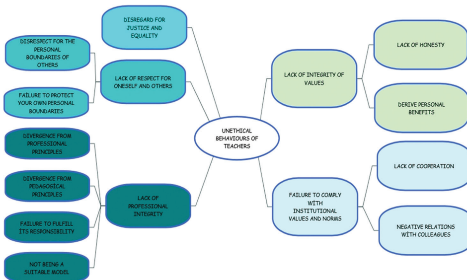
Figure 2. Themes and categories related to the main theme of teachers’ unethical behaviors

According to Table 3, the theme of “deprivation of values integrity” which consists of two categories, in the category