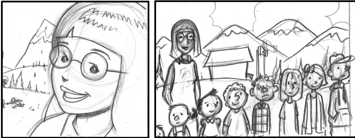
Fig. 5: Avatar sketches produced by Julian Lawrence for “Katrina’s Story.”

characteristics and begins by drawing simple geometric shapes, ovals for heads, and ovals for body parts, and so forth (see Fig. 5).