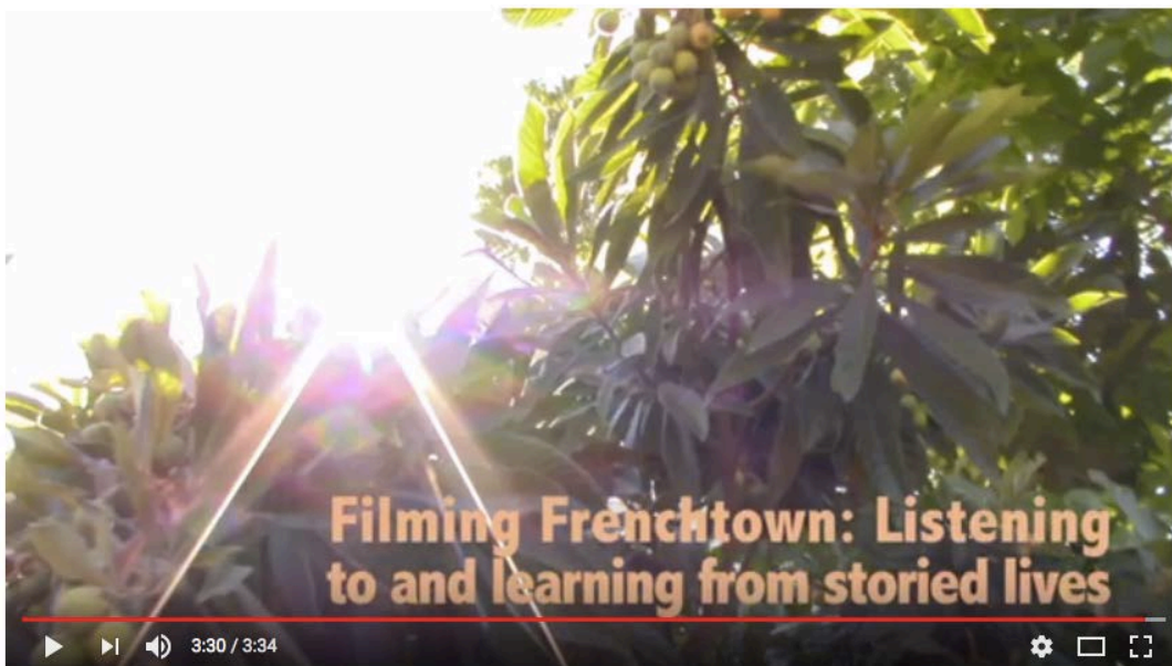
Fig. 6: Filming Frenchtown: Listening to and learning from stories lives [Video contribution edited by the authors, using teen footage: https://youtu.be/XxTTUxlvnsA ]