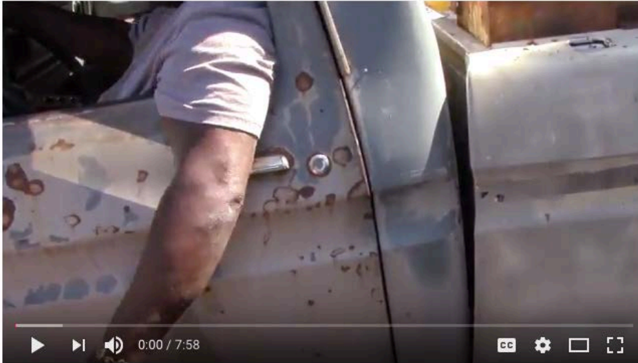
Fig. 4: F-Cubed: Interview with the Bossman [Video contribution by teen participants: https://youtu.be/g8SY4UcsnTc ]