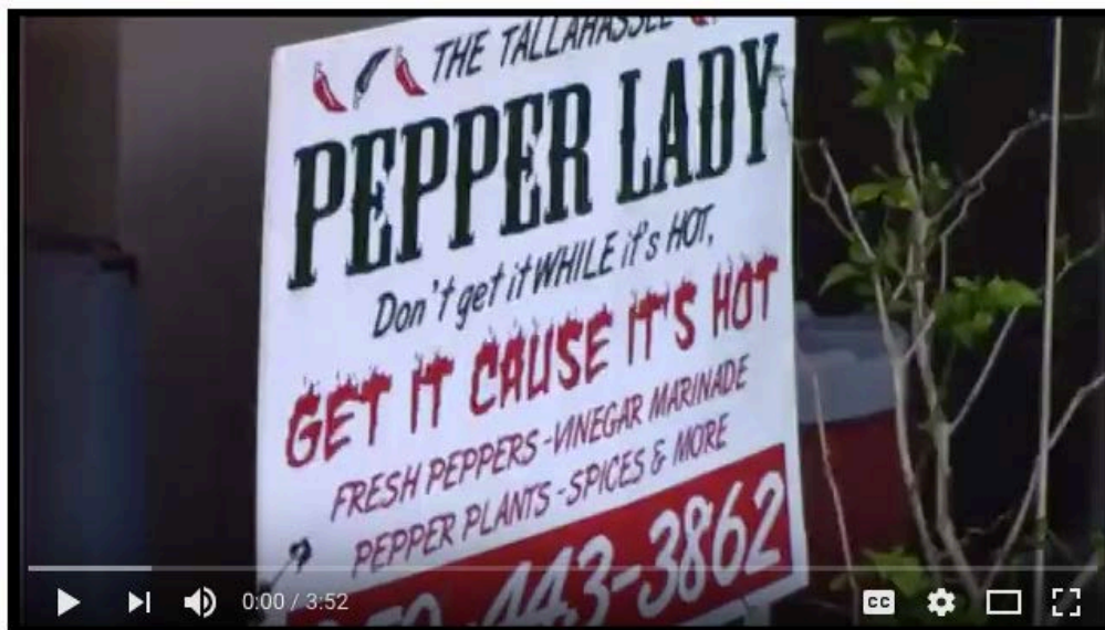
Fig. 3: F-Cubed interview with the Pepper Lady [Video contribution edited by the authors, using teen footage: https://youtu.be/onQ0Aj-MAjQ ]