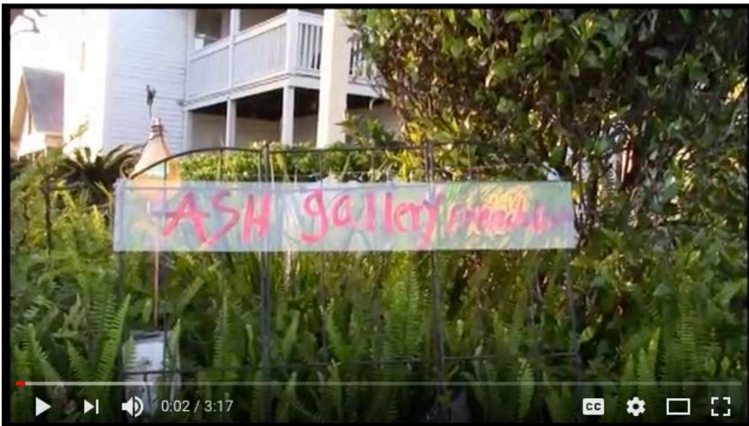
Fig. 5: F-Cubed interview with the “Art Lady” [Video contribution edited by the authors, using teen footage: https://youtu.be/eHVDqpHSB8A ]

Our meeting with the Art Lady provided a lot of background information about the history of Frenchtown, but what resonated with the teens was the experience of having met and talked with an artist. We found out during our conversation with the Art Lady that one of the teens painted and wanted to go to art school, a fact that hadn't come up previously, despite almost eight months of collaborating. Other teens also shared their own proclivities for artmaking and we lingered inside the gallery itself, a treasure trove of colorful, painted bottles, windows, canvases, and other restored objects. Hearing the story of the Art Lady created an opening for teens to share their own passions and hopes for the future. Our interview with her didn't spark an intense interest in the past, but instead connected with a desire many of the teens held on to. This encounter invited teens to imagine themselves differently, perhaps as artists, or perhaps as young people who have the capacity to mold their life into something purposeful, just as the Art Lady had.