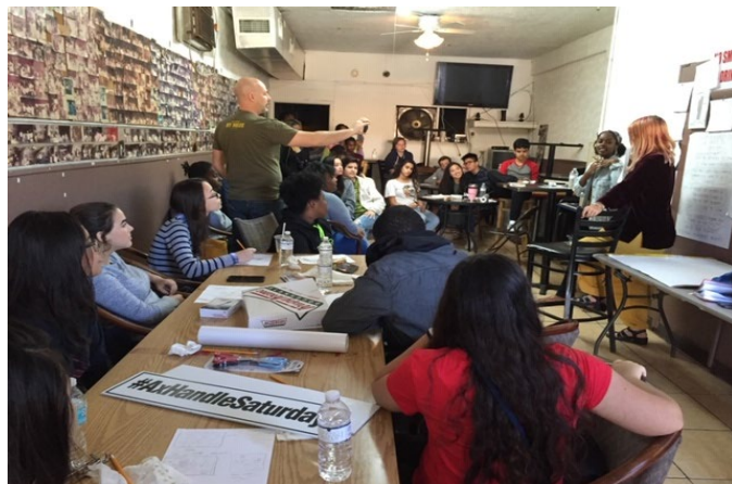
Photo 1. Hope and History Mural Project: Planning session for mural idea session inside the Eastside Brotherhood Building with the Muralist.

When the artist indicated that they wanted to paint only the faces of African American youth and simplistic symbols in the mural, my Hispanic and Asian American students raised their concerns that the mural project was meant to include the diversity of youth and their voices. They fearlessly disagreed with the artists' preconceived images that seemed to disregard their input. The meeting ended in frustration. Shortly thereafter, another meeting for student volunteers to return to plan new ideas for the mural was called on a Saturday (Photos 2 and 3). The students' new input about the visuals were considered. The community members were also invited to the meeting. Based on the students' input, the hired artist changed her design. Parents were very understanding with the organizers of the mural and trusted the process to allow their children to continue with the project.