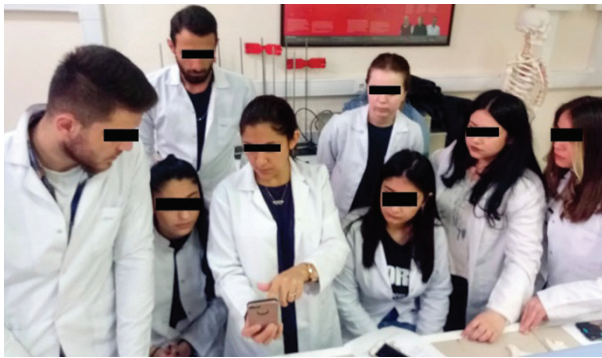
Figure 3. Pre-Service Teachers' Interaction with the MAR Application.

In this stage, dissection of the organ to be examined in the laboratory setting was performed by the pre-service teachers in groups. First, the instructor performed a sample dissection procedure using the demonstration method to show how to determine the right and left lobes and veins of the heart in the anatomical structure of a calf's heart in such a way as to be seen by each group (Figure 4). Moreover, the pre-service teachers