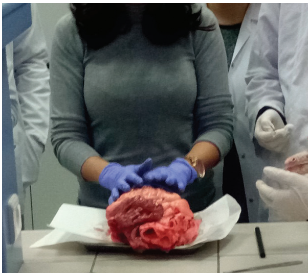
Figure 4. Heart Dissection Performed by the Instructor.