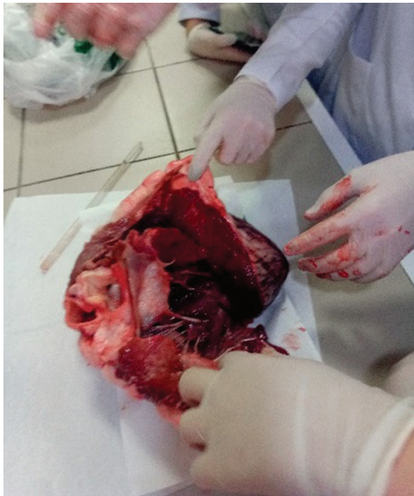
Figure 5. Heart Dissection Performed by the Pre-Service Teachers in a Group.

In this stage, associations were made as a result of the investigation of the anatomical structure of the heart using both MAR application and dissection, and they were related to daily life. The associations and discussions were made according to the questions in the worksheet (Application 4. Worksheet: MAR and Dissection Relation-Heart). In this context, the pre-service teachers made evaluations by explaining which of the structures in the MAR application were concretely observed during the dissection operation, how the determination of the structures was performed and what the relationships between these structures were.