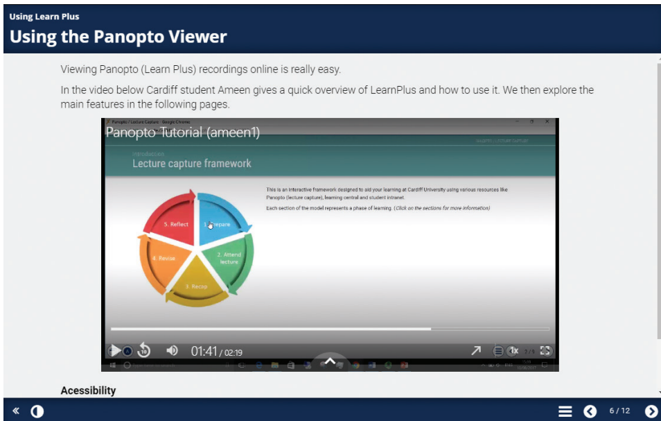
Figure 4. Screenshot showing a learning object created as a result of findings from the CUSEIP SCHOOL project. The page shown incorporates a video tutorial created by the student on the earlier CUSEIP UNI project.

Student partnership may afford educationalists a unique opportunity to engage in participatory conversations that bridge the gap between data (particularly in the form of learning analytics) and the real and varied learning experiences of individuals and groups of students. We have seen examples of partnership at school and university level, but there may be additional value in exploring lecture capture through partnership at the course level, encouraging academic staff to open detailed and creative conversations with their students about the use of lecture recordings in the learning process, in an attempt to design inclusive curricula and pedagogical approaches that best meet learners' needs (Morris, Swinnerton, and Coop 2019). Gaining more nuanced insight into study habits would no doubt assist with this.