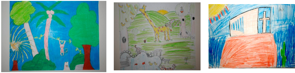
Figure 1. Nature landscape drawn by a 10-year-old girl (left), a social landscape drawn by a 10-year-old girl (the girl with long hair behind the flowers is looking at what is going on in the environment) and a built landscape drawn by a 12-year-old boy (right).

Illustrating a pure nature landscape was more popular among the older students, 3rd–6th graders (about 70%), than among the 1st–2nd graders (43%) (Figure 2). This indicates that older students may be more appreciative of undisturbed nature than their younger schoolmates.