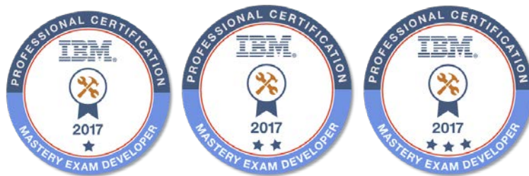
Figure 2. Tiered badging system. IBM uses stars to indicate the level of skill a particular badge represents.

Badge scope. Open badges can represent any number of skills or experiences; however, most badges are designed to represent distinct individual skills or accomplishments. In such settings, tiered systems with multiple badges (i.e., beginner, intermediate, expert) can be used to represent complicated skills.