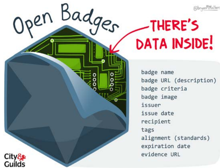
Figure 3. A visual representation of the kinds of data that can be included in an open badge. Adapted from “Open badges (P.S. there’s data inside..),” by Mathers, 2019 ( https://bryanmmathers.com/open-badges-data-inside/ ). Image is licensed CC-BY-ND.

Badge images. Although metadata often explains the significance of a given badge, the badge image is what gives the first impression. One study found the credibility of an entire program can be lowered by less aesthetically pleasing badge images (Dyjur & Lindstrom, 2017).