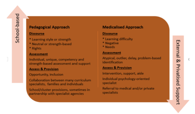
Figure 1. Comparing traditional approaches to dyslexia support.

and Development, 2018). The scope of this reframing is relevant for principals, teachers and education psychologists alike.