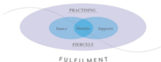
Figure 2. Practising Fiercely: Fulfilment through Stance, Supports and Stamina

A thematic analysis of specialist teachers' stories (Braun & Clarke, 2006) guided the development of a framework for harmonising who teachers are with what they do (Korthagen, Kim, & Greene, 2012). This is a framework for fulfilment comprised of five separate but interconnected elements. Fulfilment connotes teachers' sense of living and working in ways that embody their values. Practising fiercely includes the ways teachers frame and co-create their roles to enact their stance, supports and stamina in harder and softer ways. Stance and Supports contribute to our Stamina. Each construct has individual and collective aspects, signified by the diagram's wavy line.