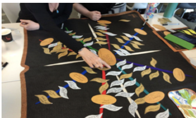
Figure 1. Participants engaging in one Ketso® activity

Ketso®, a structured concept mapping tool for participatory research (Furlong & Tippett, 2013) was used in both formal group meetings to develop participants' thinking and collaboration, and to genuinely bring local knowledge to solution-finding (Tippett, Handley, & Ravetz, 2007, p. 9). The tool enabled essential components of research alongside Māori, including: Māori knowledge; relationships; self-awareness; relevance; power-sharing and unleashing potential (Macfarlane and Macfarlane 2013).