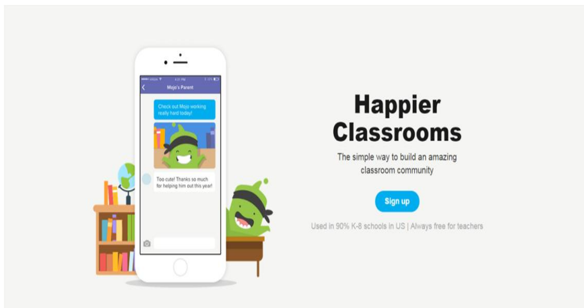
Figure-1. Classdojo website, the first page that appears for the user to register or sign up.