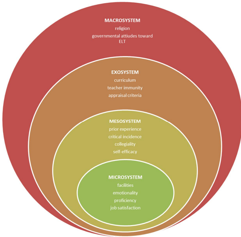
Figure 2 The results of qualitative analysis of factors influencing LTC at different ecological system levels