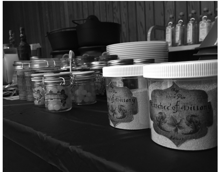
Figure 2. Potion ingredients—actually common household substances

ally are ordinary items that will not catch the attention of Muggles—such as a can of beans.