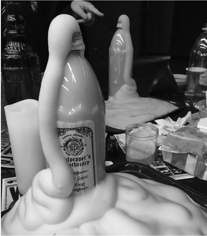
Figure 3. Polyjuice potion

Experiments with leftover plastic Halloween cauldrons showed that, in the absence of a confined structure with a narrow opening, the potion would merely bubble. But a bubbling cauldron is a nice thing for a witch or wizard! In making this potion, the children would practice reading the sequential steps of a recipe and measuring liquids and solids. Furthermore, they could experiment by varying the amounts of the ingredients to see if the results would also vary. This feature was designed to engage participants in critical scientific thinking and spark their curiosity.