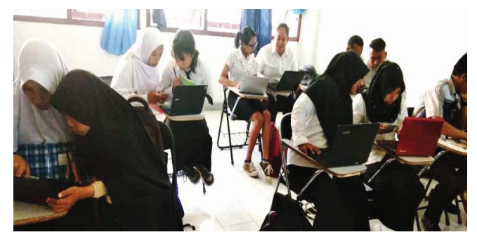
Figure 2. Lecturers provide examples of effective week analysis to be discussed with the group

At the beginning of the lecture, the model lecturer conveyed a general description of the material and provided motivation and apperception about the material analyzing the Effective Week. Students were divided into eight groups, each consisting of 2-3 heterogeneous people. Each group was given an example of an effective week analysis. Figure 2 shows the learning atmosphere where students discuss examples of effective week analysis provided by the lecturer.