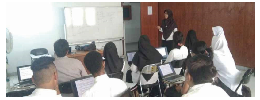
Figure 1. The lecturer gives an introduction to the KKM analysis

At the beginning of the lecture, the model lecturer gave a general description of the material and provided motivation and apperception about the material analyzing the KKM. Figure 1 shows the learning atmosphere when the model lecturer presents introductory material on KKM analysis.