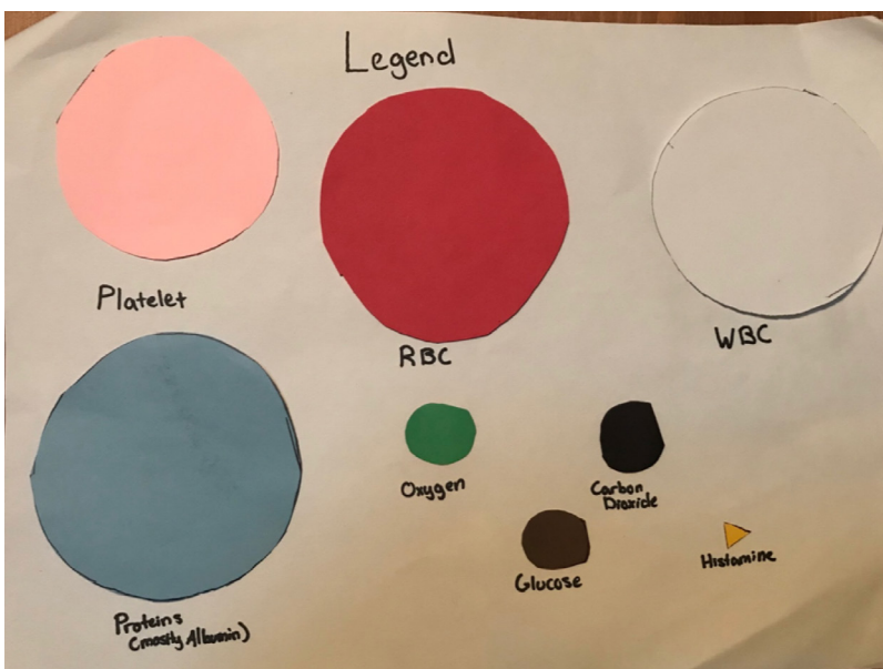
Figure 2: Representations of the molecules involved in capillary exchange

of renal transporters found that students prefer confirmation from the instructor that the model was drawn correctly to increase their confidence (Dirks-Naylor 2016). If more time is allotted, students should be allowed to make mistakes in construction and rebuild, as this can be an excellent learning opportunity. In their model of the sarcomere, Rodenbaugh and colleagues stressed the importance of allotting sufficient time during active learning exercises for thinking and processing, if life-long learning is to occur (Rodenbaugh et al. 2012). Indeed, allowing students the freedom to deconstruct, reconstruct and manipulate the capillary model based on their own independent theories and conclusions puts the responsibility of learning on the student, rather than the instructor. While the length of the model and diameter of the vessels can vary, it is