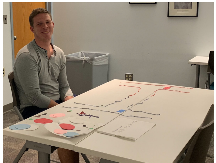
Figure 4: Near-peer student and completed model for demonstration

As the model was created as an Honors Project for the near-peer student, the model was not created in time to implement it in an actual laboratory or classroom setting in Anatomy and Physiology 103, the final course in the three-course sequence. However, the near-peer's mentor, the Director of the Anatomy and Physiology Curriculum, held a final exam review session for students.