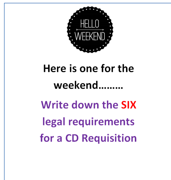
Figure 2 An example of a longer question

Once the students received a question on their mobile device, they could handle the question in several ways. Some students chose to respond to the Snapchat account with their answer, whilst others would take a screenshot of the question; whereas, a small proportion of students would open the question without saving it or responding.