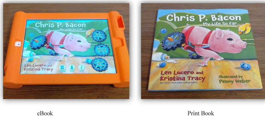
FIGURE 1. The target book in digital and print form.

Notes. Percentages may not add to 100 due to rounding. * p < .05 .