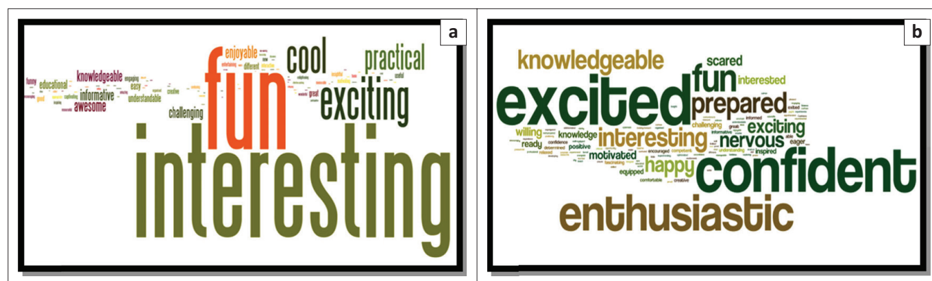
FIGURE 2: The word clouds generated by the (a) 2011 and (b) 2014 cohorts on completion of the module.

Note: The terms in bold were 'new' themes that were not present in the 2011 cohort's word cloud.