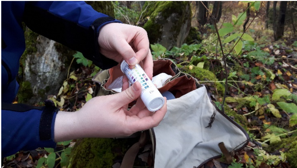
Figure 2. "Molecule detectives" outdoors, testing for glucose.

this course, acted as an outside observer during the teaching unit and conducted the individual interviews without the presence of the first author.