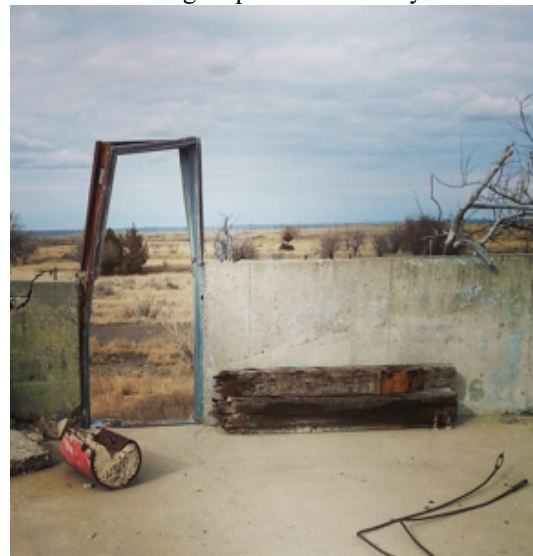
Figure 4. Weathered Farm Site Near Practicum Location

PSTs also documented the existence of compelling civic pride through rural community photographs across a wide range of subjects: community museums, restaurants/bars, farm houses/silos, transportation systems, trucks/farm equipment, churches, storefronts, and a city hall. The images selected by the PSTs suggest that it was not the newness of these places that made them important to the community, but rather their longevity across time and circumstances. From what appears to be a weathered foundation of a home (Figure 4), to pictures of highways, to downtowns, to a plaque indicating the centennial year, PSTs demonstrated interest in how age represented rurality.