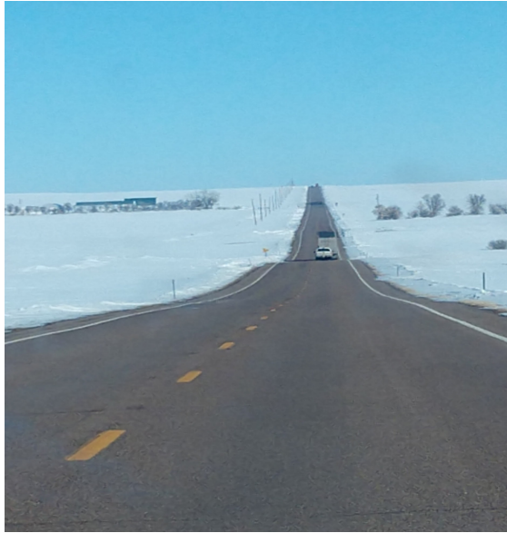
Figure 5. A Highway Outside of a Host Community

Physical environment photographs also played a significant role in the framing of rurality for PSTs. Extreme weather and the vastness of landscapes in both Northern and Northeastern Montana had an influence on PSTs' interpretations of rurality. Figure 5 portrays a United States highway that is seemingly engulfed by the vast blue horizon. Images of weather assisted in conveying emotion in regard to the rural setting, appearing to have a certain element of severity, which may, or may not, have corresponded to what PSTs were used to back "home." Taken together, PSTs' photos seemed to reveal how age, physical environment, and weather become integral components in the development of a rural teacher identity and as such, become a factor in the PSTs' consideration of teaching in a rural school/community.