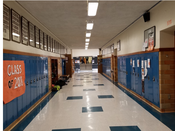
Figure 3. Artifacts of Pride in a School Hallway

photographed images of mascots, trophy cases, district-mission statements, celebratory posters, common spaces, locker decorations, and walls lined with pictures/names of graduates (Figure 3).