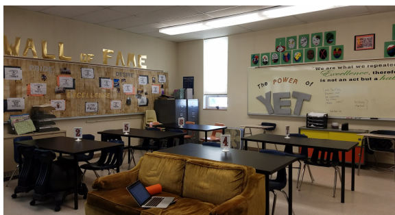
Figure 2. Recognition of Classroom & Community Involvement

Relatedly, PSTs spoke about the pride they felt while in their designated rural schools and