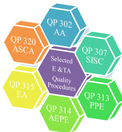
Figure 2. Selected quality procedures of education & training affairs at Jubail Industrial College