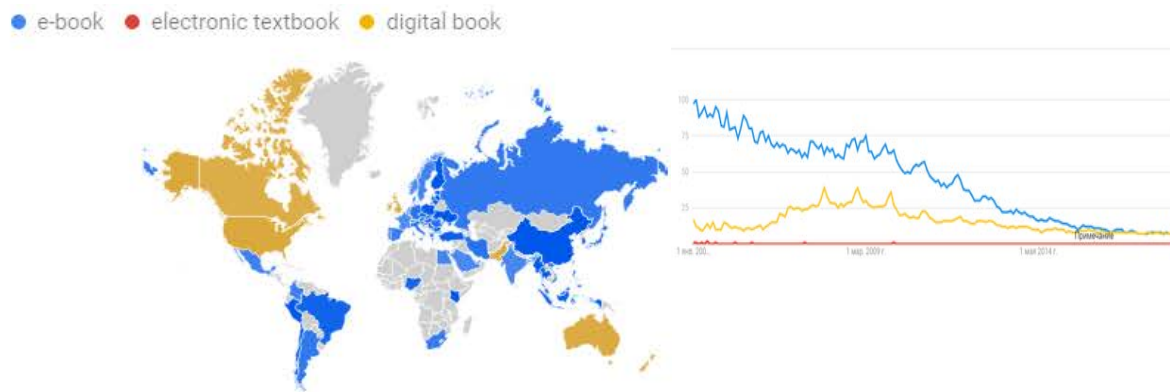
Figure 1. The analysis of search queries for using the terms e-book, e-textbook, digital book in Google's trends

The evolution of electronic materials from the earliest implementations at the beginning of the age of the Internet until today determines that most e-books are the original versions of classical (printed) analogues. This does not provide them with a particular advantage in using information technology. The first e-books were created by the volunteers manually, and the development of ICT and digitization or scanning allowed to create and maintain the work of well-known digital libraries and encyclopedias ( https://www.wdl.org , https://books.google.com , www.theeuropeanlibrary.org ).