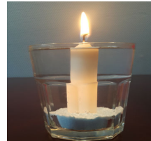
Figure 2. Inside the box Figure3. Inside the glass

Then, questions are asked to stimulate students' thinking about the topic: Why does not the candle melt in the water?; Will the candle never melt?; Will this activity give the same results for other liquids?