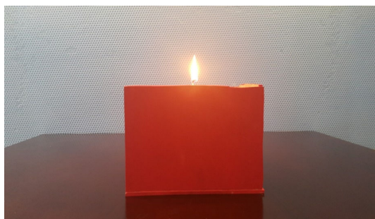
Figure 1. Outside the box.

The mechanism shown in Figure 1 is prepared in advance and brought to class so that it can be seen by every student. Students are divided into random groups of 3-4 people. The candle in the box is burnt. The students observe the candle flame from below the eye level, but they cannot see inside the box. Observation continues for a while. Students observe that the candle in the box does not melt or disappear or shrink. Ask students what might happen in the box.