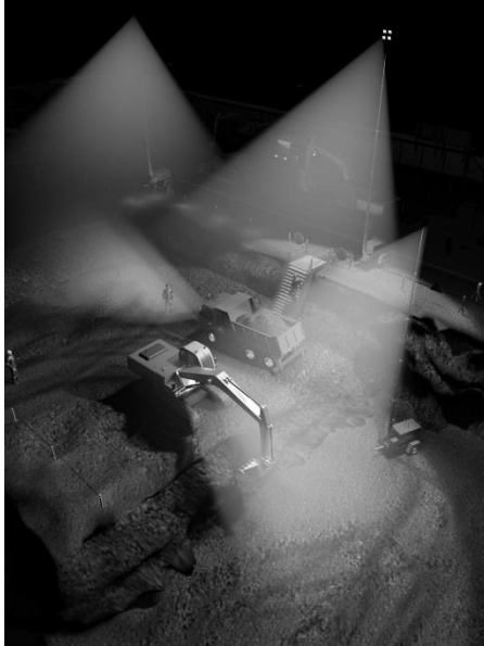
Figure 3 Poster "Artificial Lighting of the Construction Site"

From Figure 3 it can be seen that the three-dimensional posters simulated production situations, equipment and mechanisms, various conditions for the conduct of work and specialists involved in the production process. Creation and implementation of three-dimensional posters allows you to "popularize" learning. "Popular" learning is based on the philosophy of the Brazilian teacher Paulo Freire (2000) and allows you to enhance the learning activities of students. The essence of "popular" or "stimulating" learning is that, in the process of studying educational material, students consider specific issues and situations that occur in production. And this involves a dialogue between the teacher and the trainees.