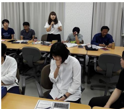
Figure 5 FGD Participant

FGD participants consisted of UNNES Research Team, the Partner Lecturer, and graduate students of IDEC of Hiroshima University. Students who participated in FGD were quite a lot. There were students from various countries, namely: Students from Indonesia, Philippines, Cambodia, Laos, Egypt, Rwanda, and Japan. Figure 5 below illustrates the atmosphere of the FGD path, where an IDEC graduate student was giving her opinion.