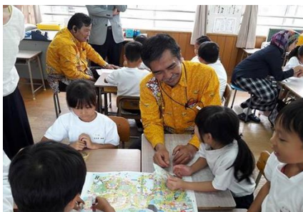
Figure 4 Interview the Students

In figure 4, the research team played with groups of students. Through this mathematical game, the research team got the opportunity to interview directly and could observe the characters of the students related to the value of mutual cooperation and the integrity of the students. In this interviewed, the research team guided by the teacher.