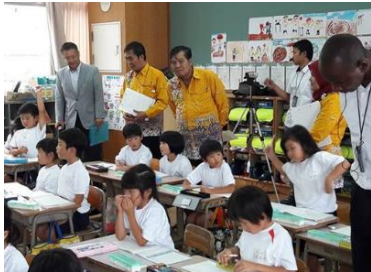
Figure 3 Observation in the Classroom

In Figure 3, it appears that the Partner Lecturer guided UNNES Research Team (yellow-dressed) to carry out observation activities in class. This activity was equipped with translator, equipment in the form of earphone and handycam. This equipments were provided by IDEC students of Hiroshima University.