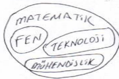
Diagram 2. T7 participant teacher's drawing