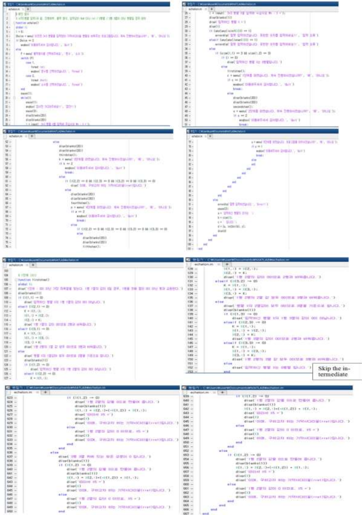
Figure 2. Process Matlab m—file for reduced row echelon form