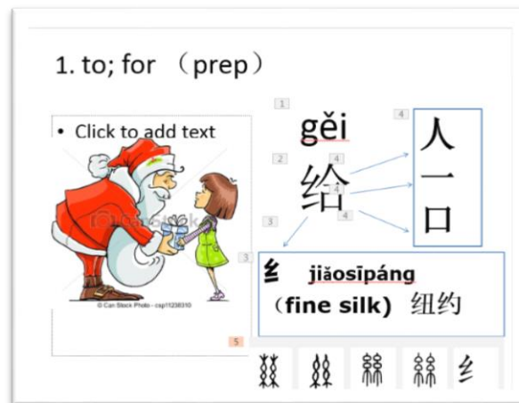
Figure 2. Character PowerPoint design.

During the explanation, the instructor will provide some examples of sentences in which the character is used. The PPT videos will be assigned to students to watch before class. Students are required to record the vocabulary and identify radicals and concrete words when writing character sheets. This “flipped learning” style will engage students in the learning process and helped students develop their awareness of radical and character knowledge, while becoming familiar with the vocabulary before class.