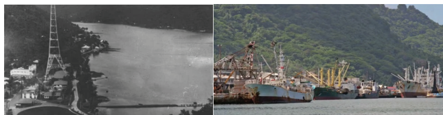
Figure 4 The changes in Pago Pago Harbor from 1940 to present day

Since 98% of Samoans identify as a Christian denomination (2006 Census) religious beliefs also guide what is socially acceptable among