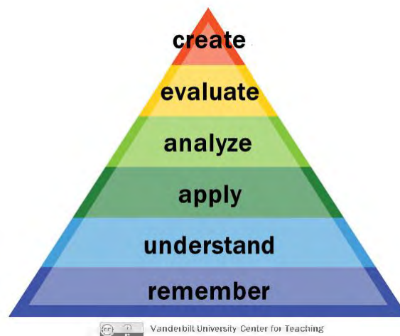
Figure 2. Cognitive process categories of Bloom's taxonomy (Vanderbilt University, 2018)

As described above, version 1.0 was mainly based on the work of Ryan (2011) and further developed, first to address some of the challenges faced when applying it, in terms of consistency and ease of use, and later to align it with Bloom's taxonomy. Bloom's taxonomy helps educators categorize learning objectives, which is important for a variety of reasons, including helping educators to see the objectives from the student's point of view, to see the relationship between knowledge and cognitive processes of the learning objectives, and to see the relationship among objectives and how they are taught and how learning is assessed (Anderson & Krathwohl, 2001). Bloom's taxonomy includes four knowledge dimensions: factual, conceptual, procedural, and metacognitive, and six categories of cognitive processes (see figure 2). The following categories of cognitive processes are listed from those that are "most commonly found in objectives" at the bottom to those that are "less frequently found in objectives" at the top (Anderson & Krathwohl, 2001, p. 30): remember, understand, apply, analyze, evaluate, and create. Anderson and Krathwohl (2001) also refer to those categories further along in the list as having a "higher level of complexity" (p. 34). Under each cognitive process category are two or more cognitive processes. For example, the category "remember" includes two processes, recognizing and recalling (see figure 2).