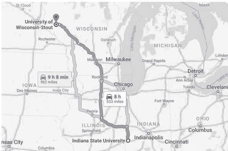
Crossing Boundaries: Indiana State University & University of Wisconsin-Stout

In spring 2018, two honors colleges—at Indiana State University (ISU) and University of Wisconsin-Stout (UW-Stout)—came together to create a cross-institutional collaboration blurring the boundaries between campuses. This project connected first-year honors students in a coordinated core curriculum of two geographically separated honors colleges. Building upon their studies of Classical mythology, ISU honors students in GH 101 Classical Cultures of Greece and Rome reviewed, advised, and critiqued screenplays composed by UW-Stout students in ENGL 113 Honors English. This coordinated project led to the production of short films that premiered at ISU's Spring Classics Fest and were submitted for competition at UW-Stout's 4:51 Short Film Festival and Exhibition . Both events took place on 6 April 2018. Drawing on our 2018 NCHC panel presentation in Boston, we highlight here