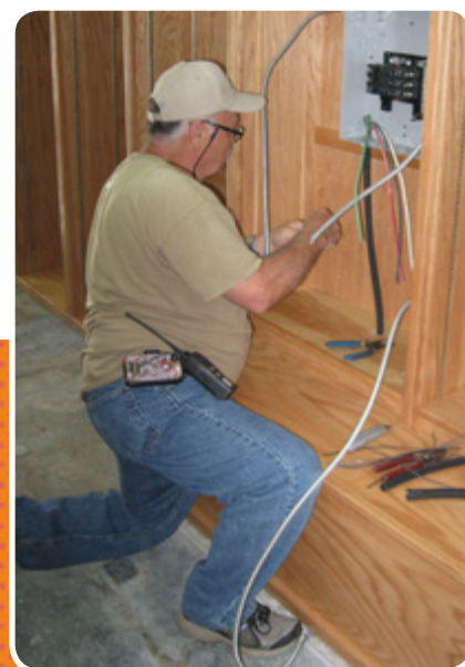
Figure 2. Custom-built slanted shelves.