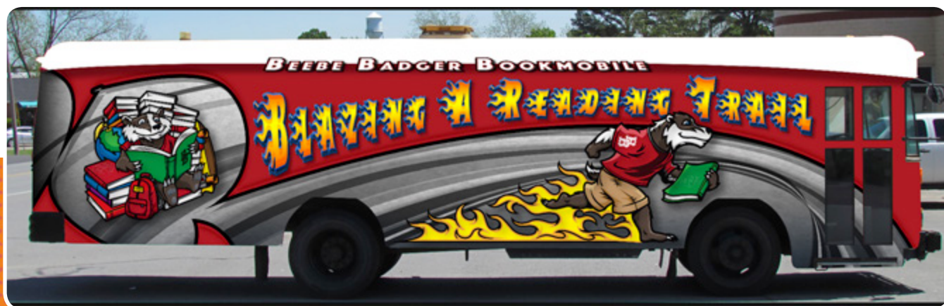
Figure 3. Eye-catching exterior of upcycled school bus.

Each summer, an average of six hundred book checkouts by young people are recorded on the bookmobile spreadsheet. (Adult borrowers are not recorded.) The ages of young patrons are recorded on the chart in table 1. Each student in grades Pre-K through sixth in the Beebe School District is provided with an account for the Scholastic