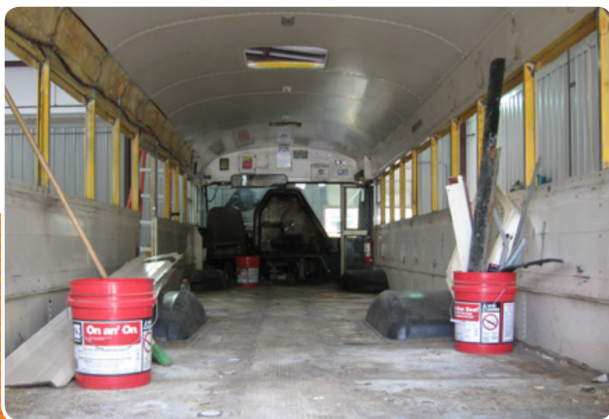
Figure 1. Gutted bus ready for conversion into bookmobile.

retrofitting on site, resulting in substantial savings to the district in comparison to the cost of conversion by a specialty company. Beebe is fortunate to have such a multi-talented workforce who embraced this project with open arms and with open hearts. This effort was truly a labor of love! To start, seats and windows were removed (see figure 1) as custom, adjustable shelves that slant to prevent books from falling while the bus is moving were built (see figure 2). The interior was painted before the installation of laminate flooring, seventeen LED lights, two air-conditioners, and a back-up camera. Interior speakers, a desk for checkout, and small benches built over the wheels completed the interior restoration. A generator was added to supply power when the bookmobile is parked. Exterior speakers, colored LED chaser lights, chrome wheel covers and exhaust tips, and a custom wrap (collaboratively designed by two district employees) ensure that the bookmobile maintains a stand-out presence in our community (see figure 3).