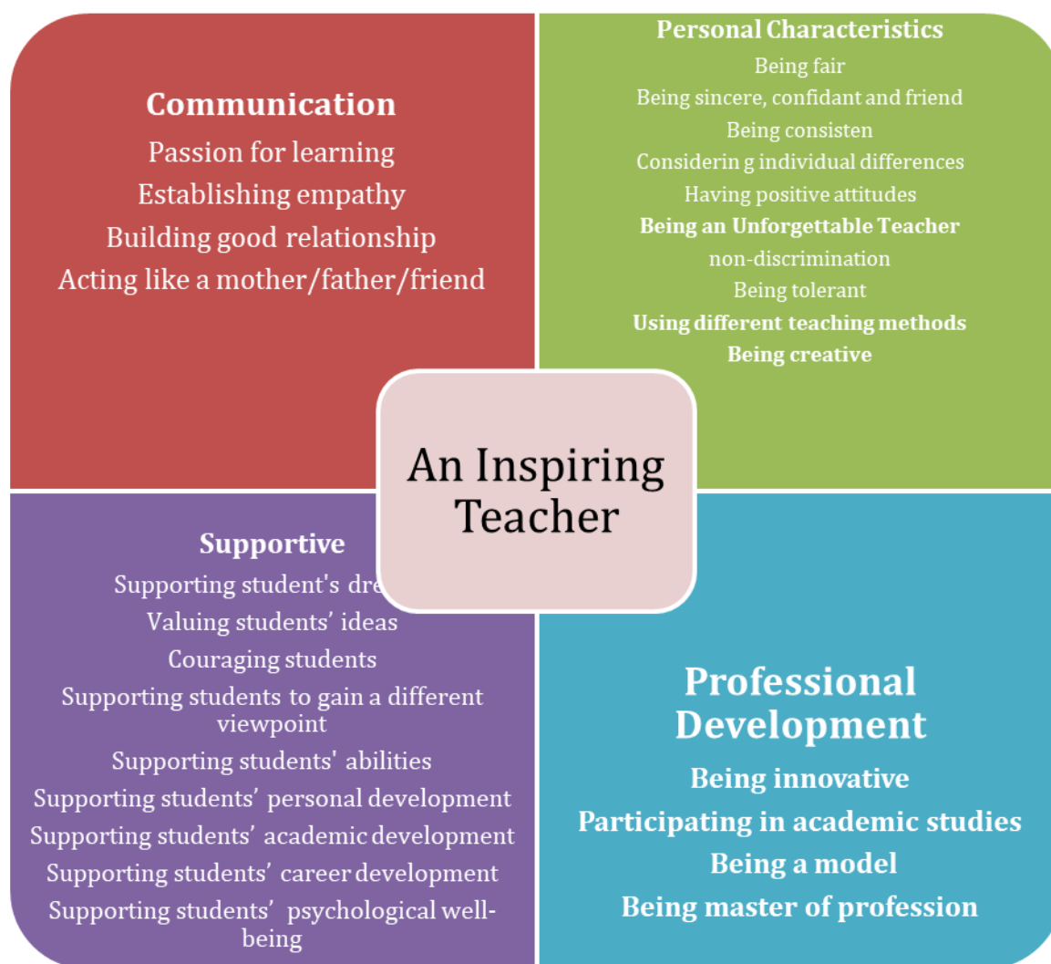
Figure 2. The categories and subcategories of the inspiring teacher

The results of this study demonstrated the characteristics that an inspiring teacher should have according to the opinions of teacher candidates. These findings that are related to the characteristics of an inspiring teacher can be discussed in the light of the related literature. Thus, it is necessary to review the previous studies that focused on characteristics of teacher.