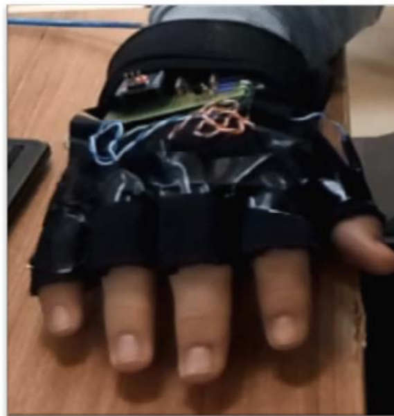
Figure 2. First version haptic glove

To identify amendments to the haptic glove, two different evaluations were made at the stage of development. In the first stage, fitness (sports) gloves were used in order to grasp the users' hands easily. An electronic circuit and a 9 V battery—as the power supply—were placed on the glove. Arduino Uno card was used to program the haptic glove. Vibrations were placed on the third knuckles of the fingers. In Figure 2, there is a visualisation of the glove developed.