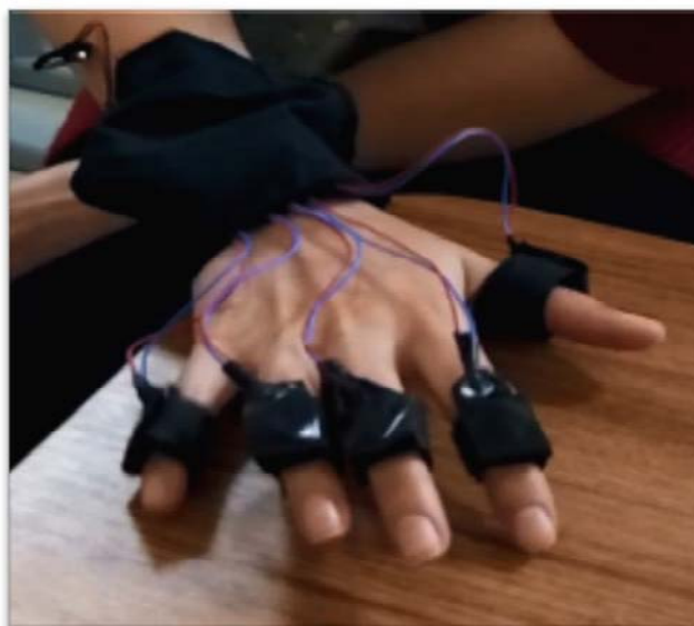
Figure 3. Second version haptic glove

With the intent of enabling users to feel vibrations more clearly and to eliminate vibration mixing, an amplifier was added to the electronic circuit, thereby increasing the power of the vibration motors. The fitness glove was abandoned based on the participants’ views in that the glove did not cover their hands directly. Instead, a patchwork glove was produced that could be adjusted according to the size of the wrist and fingers. Figure 3 presents the second version haptic glove that was modified in line with the feedback received through the first evaluation.