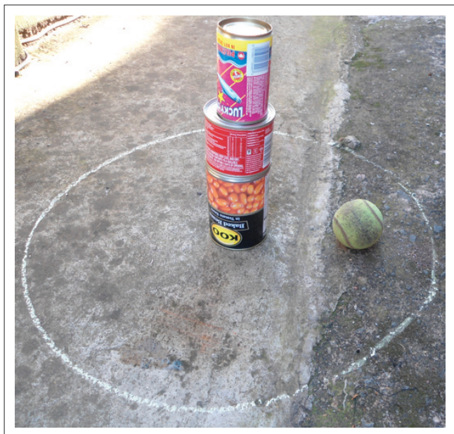
FIGURE 3: Three tins.

counted to see who had managed to collect the most, which was a significant learning experience in terms of mathematical concepts.