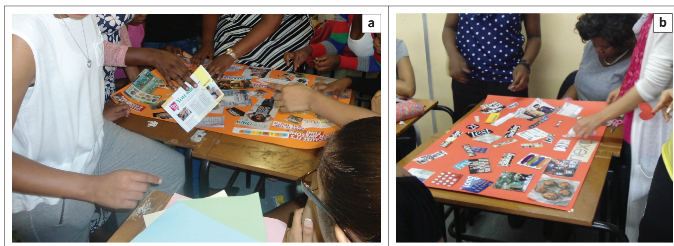
FIGURE 1: Student teachers engaging in the process of making a collage in a and b.

trusted colleagues who seek support and validate the research of another colleague so that the latter person gains new perspectives