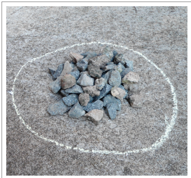
FIGURE 2: Heaped stones in a circle.