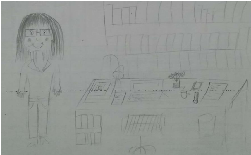
Figure 1. Sample image belongs to a gifted education teacher candidate

* Even though the code of female image was not on the markers as a stereotype, it was included in the table because it was an important finding for study.