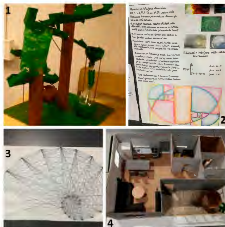
Figure 1. Examples of final products. More pictures can be found on the webpages of StarT ( https://start.luma.fi/en/ideas/the-best-of-start-2017/ ).

Figure 1 shows some examples of the final products. The marble ball game in the first picture is included in the project Ball path. Pictures 2 and 3 are both parts of the project work on the Fibonacci sequence. The final product includes a poster and a painting. In the fourth picture, there is a miniature of a house.