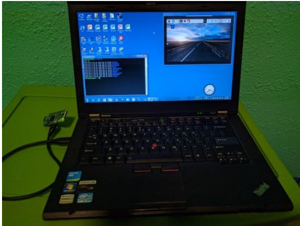
Illustration 3: Raspberry Pi Zero connected to a Windows 7 laptop with a single USB cable for power and communication. Shown with PuTTY and VNC sessions open.