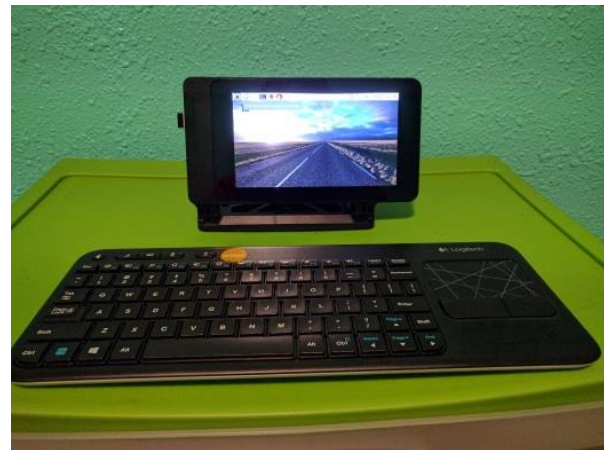
Illustration 1: Raspberry Pi 3 configured as a portable computer with a 7-inch touch screen and portable wireless keyboard.

short network patch cable between the Ethernet port of the Raspberry Pi and the Ethernet port on the laptop provides the necessary physical network connection between them. The Raspberry Pi board can be powered directly from a USB port on the laptop, so a short USB to MicroUSB cable can handle this function. A small amount of configuration on both the Raspberry Pi computer and the laptop is required to establish the network connection. Much of this configuration can be scripted or preprogrammed on the SD card image on the Raspberry Pi before the course starts.